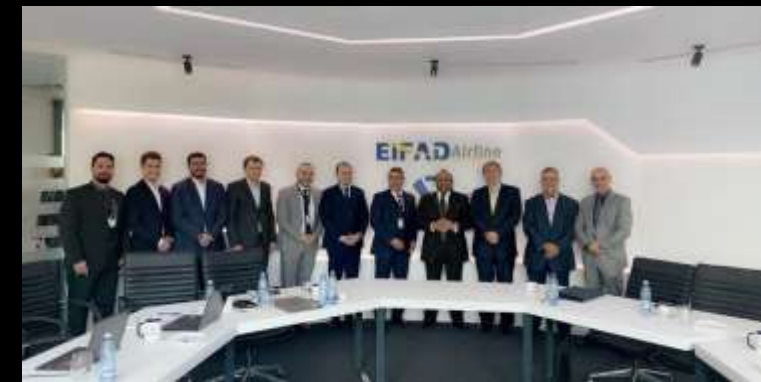
Aviation Divisions: Cargo Aviation Team and Services